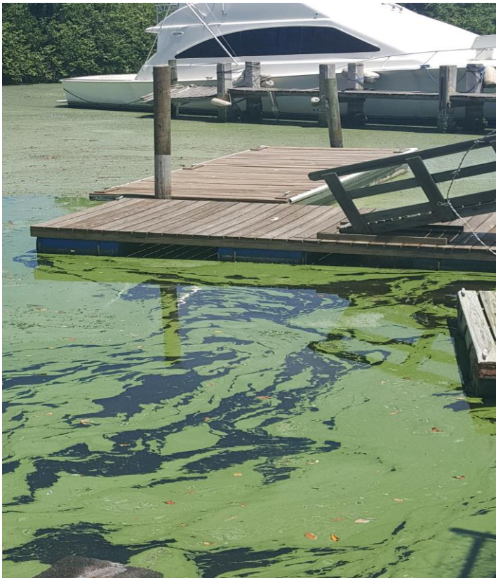
Central Marine in Rio July 11 th water sample